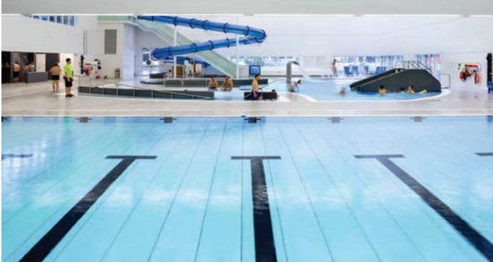
The expanded Guildford Recreation Centre now includes a 37,000-square-foot aquatic center, a larger fitness center and lobby, more office space, a bridge and 300 seats for spectators.

ROCKFON<sup>®</sup> believes our acoustic ceilings are a fast and simple way to create beautiful comfortable spaces. Easy to install and durable, they protect people from noise and the spread of fire while making a constructive contribution towards a sustainable future. To learn more, please visit www.rockfon.com , email cs@rockfon.com or call 800-323-7164 .