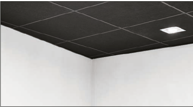
Finishing options for metal suspension systems include nearly any colour of paint, metallic coatings, and anodizing options to contrast or complement the panels. In this example, a black painted suspension system complements black ceiling panels.

project's importance factor and site class, a seismic hazard index can be calculated. This calculation, specified requirements, and determination of construction solutions should be set by a professional engineer and documented in stamped plans.