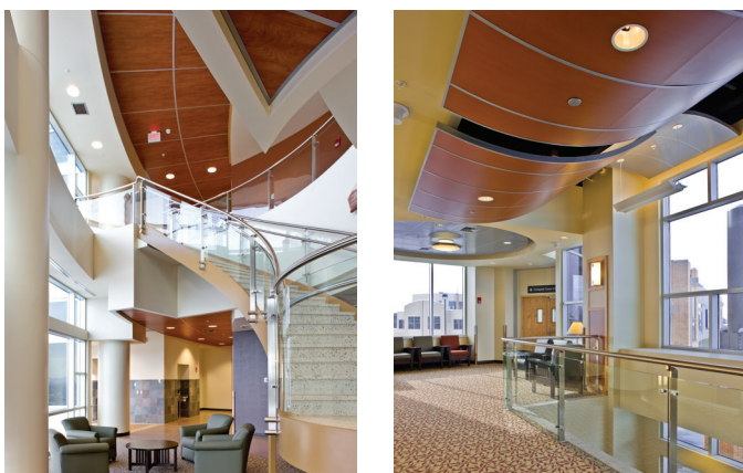
Benefis Health System's snap-in metal plank and curved metal ceiling systems are finished to achieve the look of wood for a warm, comforting space, without the demanding maintenance of real wood.

Hard ceiling panels, such as those made from wood and metal, are more durable than the soft options. Metal offers superior performance attributes and does not have the humidity and acclimatization requirements of wood. Tin and copper ceilings were the first metal ceilings introduced in the late 19th century. Compared with the elaborately decorated plaster ceilings of the 16th century, these pressed metal ceilings could be mass-produced at a fraction of the cost, and installed in a fraction of the time. Many historic tin ceiling patterns are still available today.