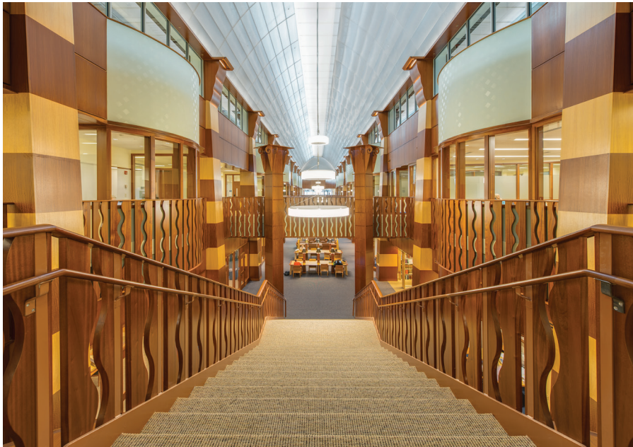
Quinnipiac School of Law features a torsion spring concealed metal panel ceiling system with Satin Silver finishes and increased acoustical performance.