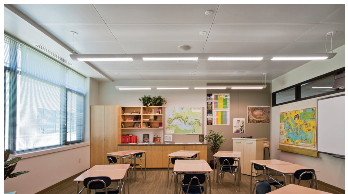
Cranbrook Kingswood Middle School for Girls relies on metal panel ceiling system with increased acoustic performance for an optimized learning environment.

As these guidelines and standards are revised during the coming years, levels are likely to be set even higher, as has happened for other types of buildings including schools and healthcare facilities.