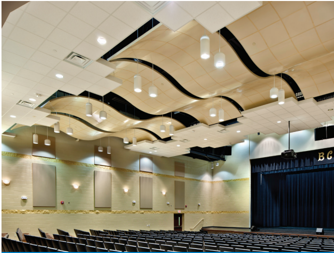
Enhancing both acoustics and aesthetics, Bradley Central High School Fine Arts Center's ceiling is composed of curved two-dimensional metal ceiling system with metal perimeter trim and suspension systems.

the suspension from view. Each curved system forms undulating ribbons. The peaks of the ribbon's curvatures are commonly called vaults and the dips are called valleys.