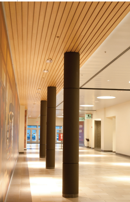
Christiana Mall's corridors showcase linear metal ceiling with wood-look painted finishes.

The spacing between the linear panels may be determined by numerous factors, balancing both form and function. If the space between the linear panels is to be closed, consider whether the “filler” should be integral to the panel or installed as an applied accessory item.