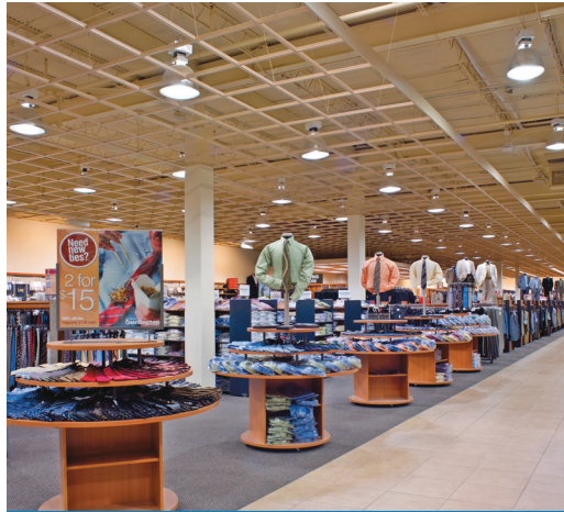
Burlington shopping mall's metal ceiling system presents a continuous, cubed, open cell appearance, and the ease of accessibility to the plenum for frequent changes in retail lighting.

As the names suggests, open plenum refers to an application where the occupied space is not separated from the space above by a continuous ceiling. These include beam systems, open cell systems, plenum masks and baffle systems.