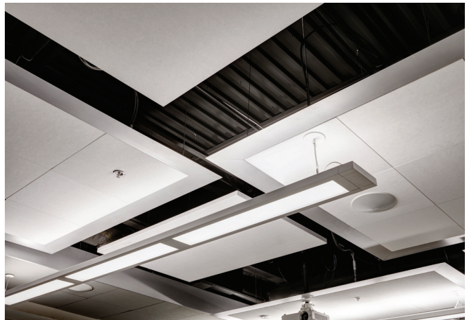
Metal perimeter trim provides a neat, clean edge for the ceiling clouds suspended within a LEED Gold-certified office in Ontario, Canada.

When ceiling designs conceal the plenum using panels, the most common and least expensive metal panel sizes are 2-by-2 feet and 2-by-4 feet in either flat or curved formats. Standard plank sizes are 2-by-6 or 4-by-6 feet. The panels and planks may be specified as square or reveal edge. Reveal panels expose the suspension in a recess detail. For curved panels, the radius of the vaults and valleys will need to be defined and usually conform to a minimum of 2 1/2 feet.