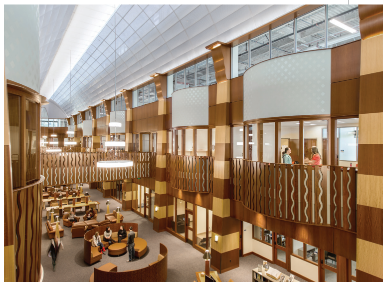
Torsion spring metal panels integrate seamlessly with factory-slotted suspension systems to provide a clean-monolithic concealed ceiling solution with ease of accessibility for Quinnipiac School of Law.

Hook-in and hook-on metal ceiling panels, as their names describe, are installed by hooking into specialty drywall suspension systems. Panels can be removed or replaced easily without tools to achieve downward access to the plenum.