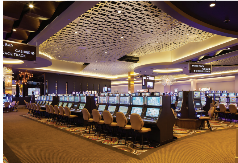
Scioto Downs Casino selected open plenum metal ceiling to mask the lighting, HVAC and security systems, and a custom pattern design to accentuate the gaming area.

maintains openness, standard beam systems range from 1 to 6 inches wide by 1 to 8 inches high to create modules in sizes 1-by-1-foot to 4-by-4 feet.