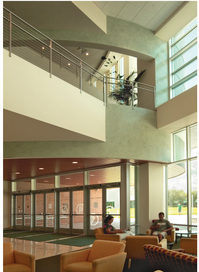
The University of South Florida Marshall Student Center's ceiling design unifies and connects the interior and exterior spaces with linear metal planks.

Helping minimize these issues, CISCA's technical guidelines reference ASTM C-636 Standard Practice for Installation of Metal Ceiling Suspension Systems for Acoustical Tile and Lay-In Panels . ASTM C-636 was updated most recently in 2013 and should