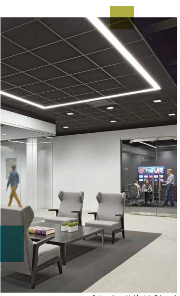
Project – Havas Worldwide in Chicago, IL Product – Rockfon Color-all™