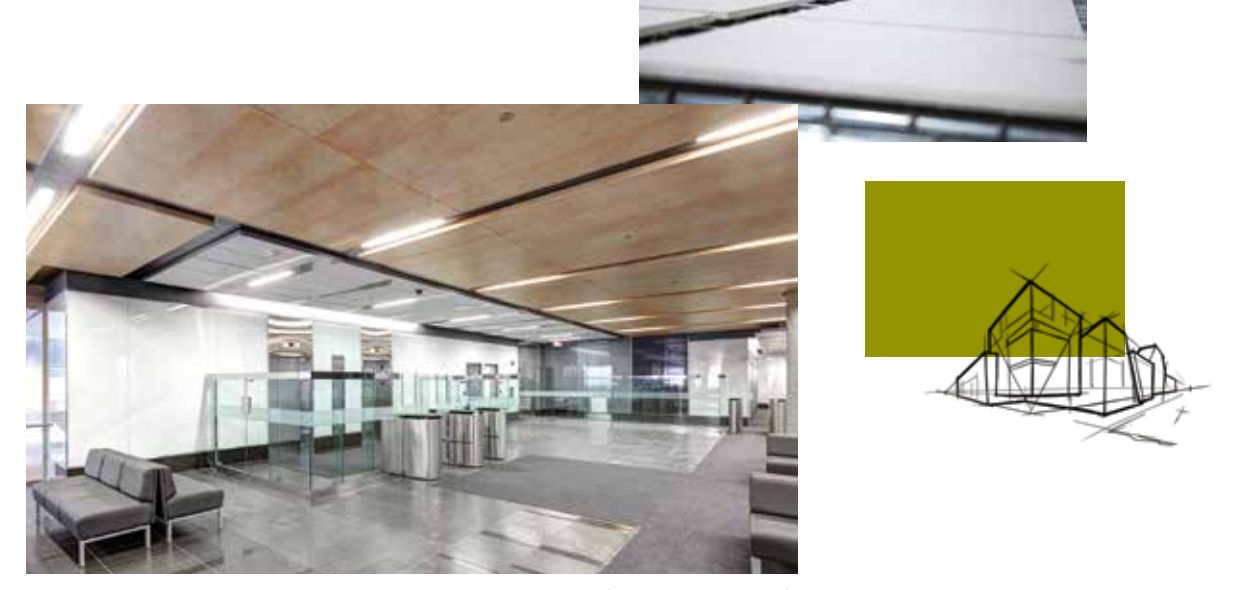
Project – 90 Elgin in Ottawa, Canada Product – Rockfon Planar® Macroplus®, Rockfon Spanair® Hook-on

Rockfon specialty metal ceilings are designed and fabricated to exacting specifications and the highest manufacturing standards. They are available in a wide range of shapes, sizes, and finishes, and exist in standard and custom configurations.